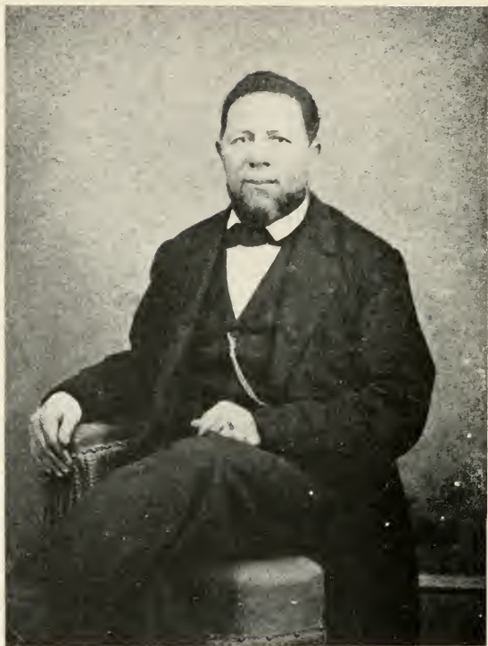
HON. HIRAM R. REVELS.

The first colored man that occupied a seat in the U. S. Senate.